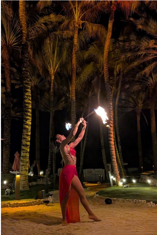
Video – Click to Play

Salsa Dancers: Helped to add some local flair + interact with guests, showing them a few moves