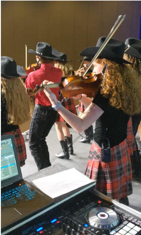
Video – Click to Play

DJ for Conference: Engaged with the audience as needed, played Walk In/Out Music, Stings, and music for the gala + after party