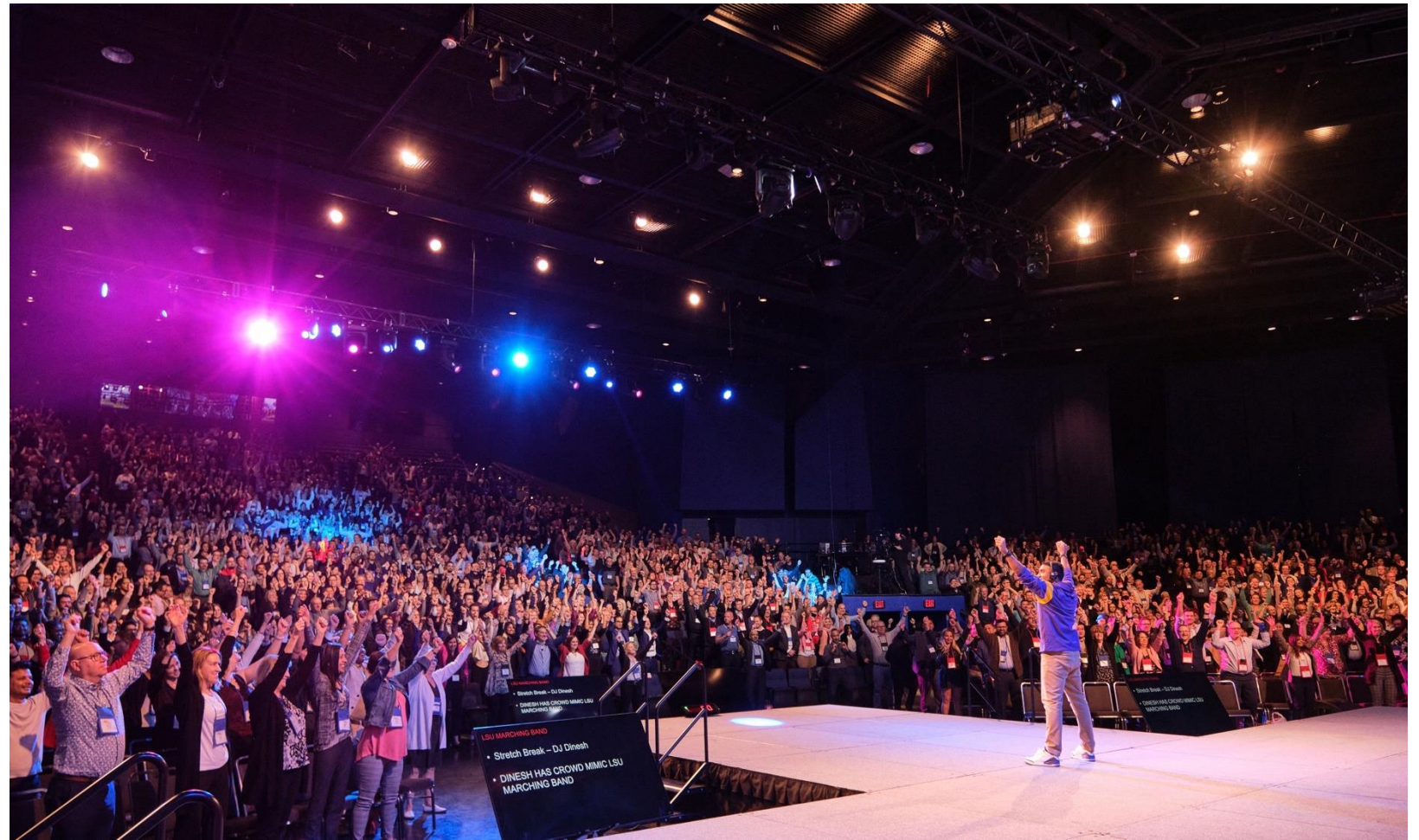
Pumping up the audience as the on-stage Emcee / DJ