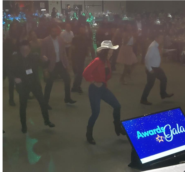
Video – Click to Play