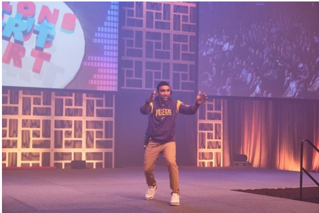
Video – Click to Play