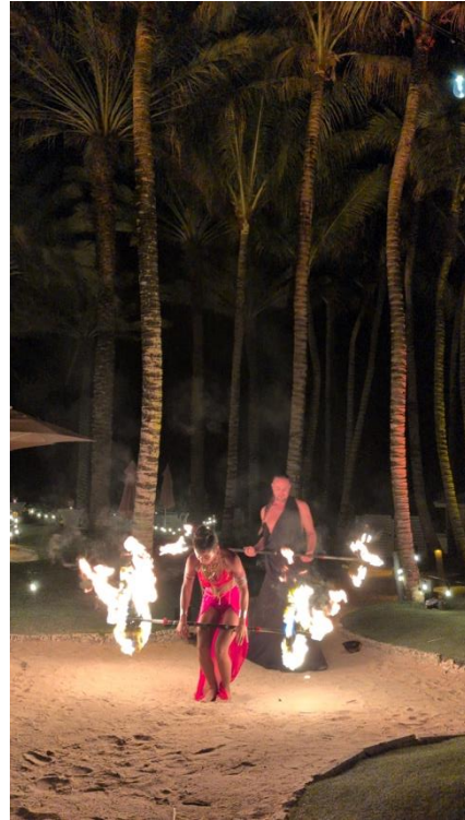
Video – Click to Play