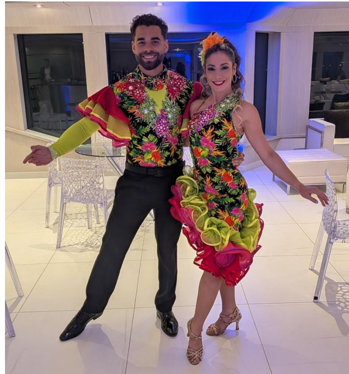
Video – Click to Play