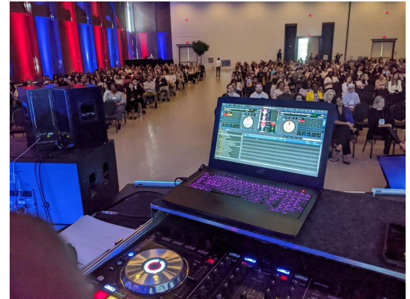
My On-Stage View as Emcee + DJ